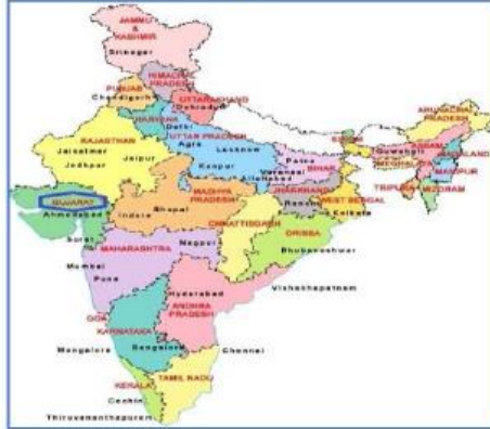
Gujarat in India