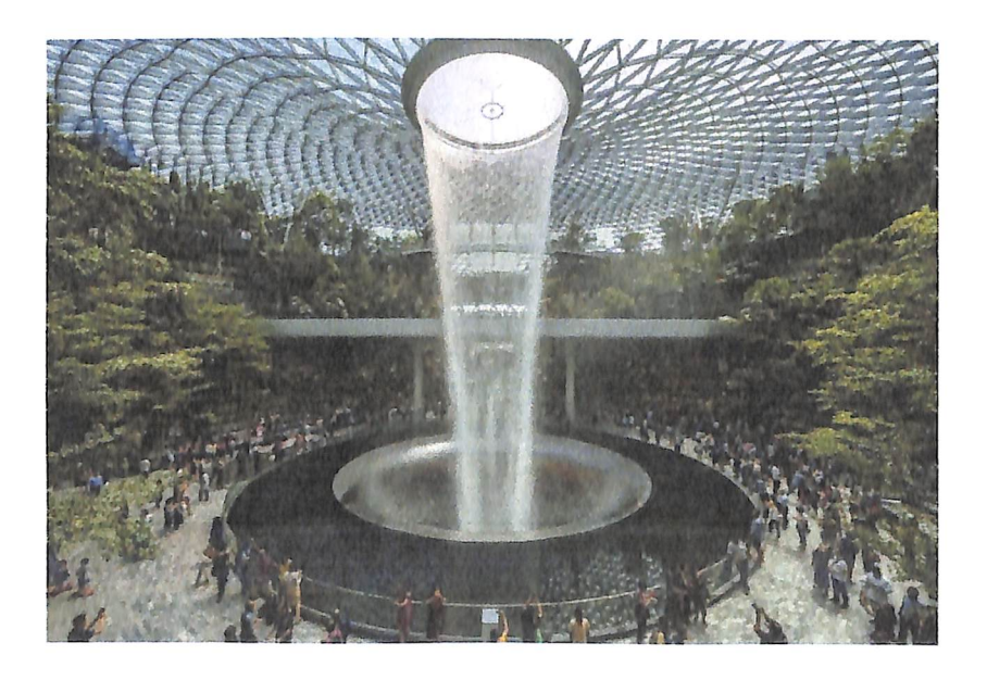
Figure 8: Rain vortex at Changi airport