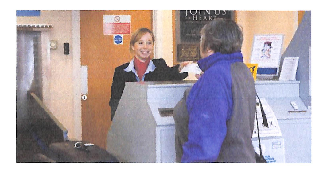
Figure 7: Security and check-in

Each staff is assigned to do specific duties assigned to them. If a passenger approaches a staff and complaints on an issue which the staff cannot handle, the staff is responsible to hand over the issue to the responsible staff.