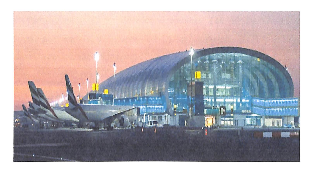
Figure 1: An airport

The other cities will have smaller airports. Long travelling are done through hub airports. If a passengers wants to travel to a long distance and there is no direct flight operating from that smaller airport near them, they are taken to the next hub airport where the flights are available. This is called hub and spoke system. This system was formed in 1973. New technologies are invented day by day in airports.