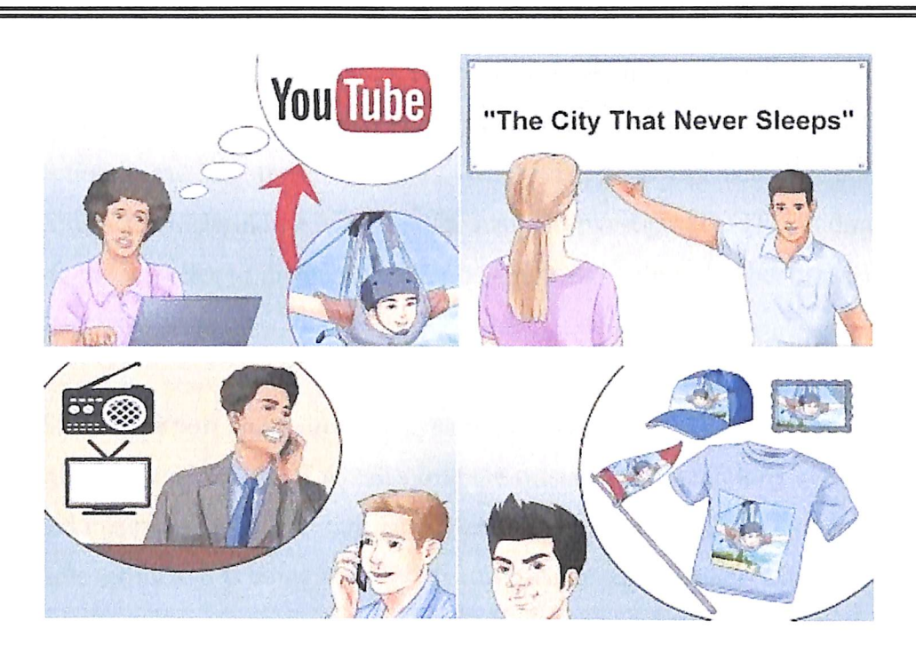
Figure 3: Strategies to promote tourism.