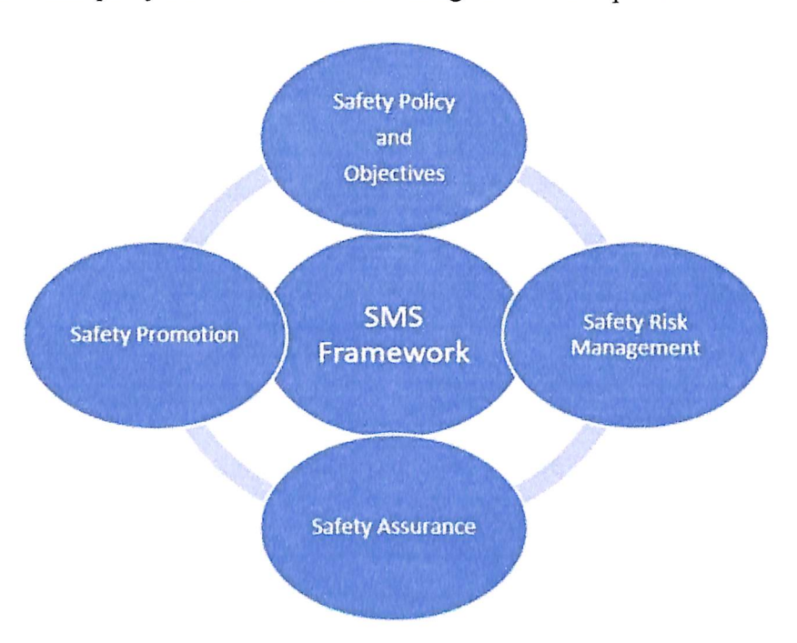
Figure 6: SMS components

Safety assurance : Safety Assurance functions give certainty that the association is meeting or exceeding its security goals. The functions like interior audits, outer audits, and remedial action give input on the exhibition of the association, as well as adequacy of executed hazard mitigation techniques.