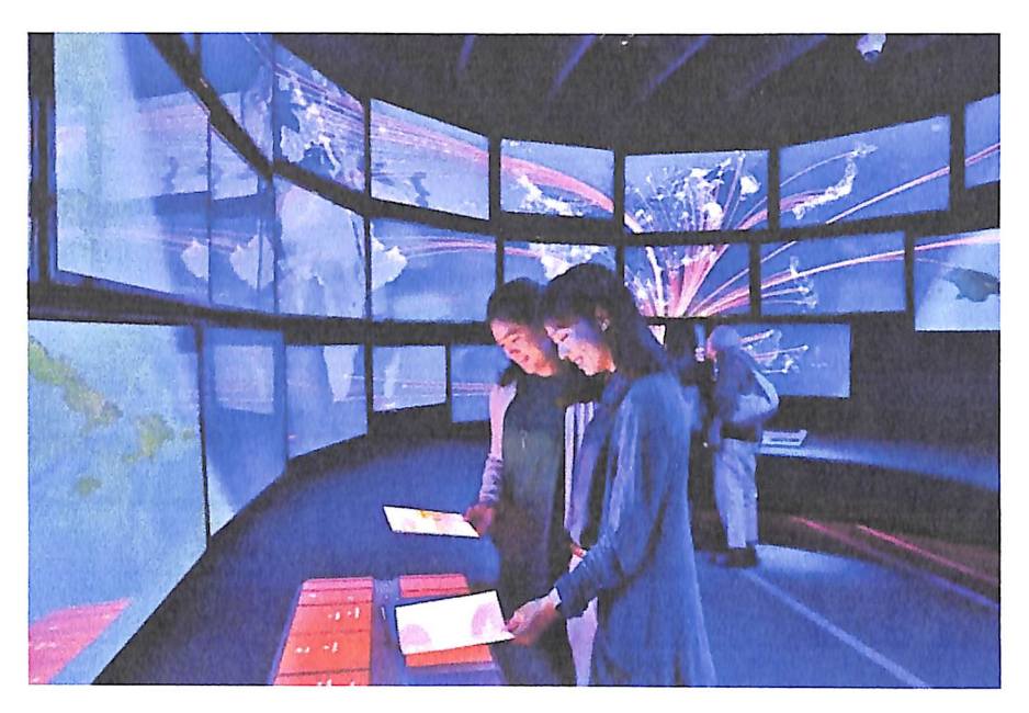
Figure 9: Changi Experience Studio

A entry ticket is required to enter into the canopy park which costs 4.50 Singapore dollars for Singaporeans and 5 Singapore dollars for non- residents. Additional cost are required to entre other entertainment areas like maze, experience studio, bridge and nets. In terms of customer service and security, Changi airport has won has 500 awards. From two distinct lounges with 24hour napping spaces, showers and spa facilities, to hotel and pool pleasantries, this airport likewise incorporates Singapore Tours made for passengers those who are in transit for over 5 hours who are allowed a special pass to leave the airport on one of two city visit choices, Nature Trail and dining and entertainment choices. This airport earn its major profit from duty-free shops. Ten garden areas are spread across the four terminals of the airport. In terminal 1, the gardens are cactus garden, piazza garden, sculptural tree garden, water lily garden. In terminal 2, enchanted garden, orchid garden, sunflower garden. In terminal 3, butterfly garden and crystal garden. And in 4<sup>rd</sup> terminal, steel in bloom. There is a collection of artworks done by nearby and international famous artists which made the airport infrastructure completely attractive.