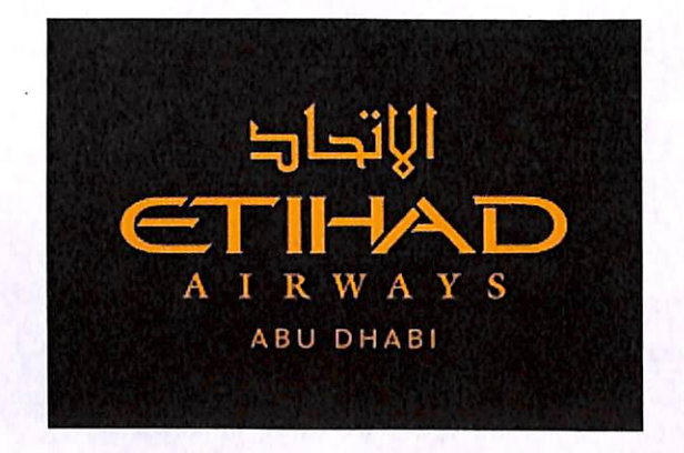
FIGURE 8: LOGO OF ETIHAD AIRWAYS

investments in the participating airlines, as well as holding a stake in Virgin Australia, which is not officially listed as an Etihad Airways Partner. Booking for these airlines is consolidated under one network. As of June 2019, Etihad serves 81 passenger and cargo destinations across Africa, Europe, North America, Asia and Australia from its hub at Abu Dhabi International Airport. Until terminating the São Paulo service in late March 2017, Etihad Airways was one of the few carriers to have passenger services to all six inhabited continents.