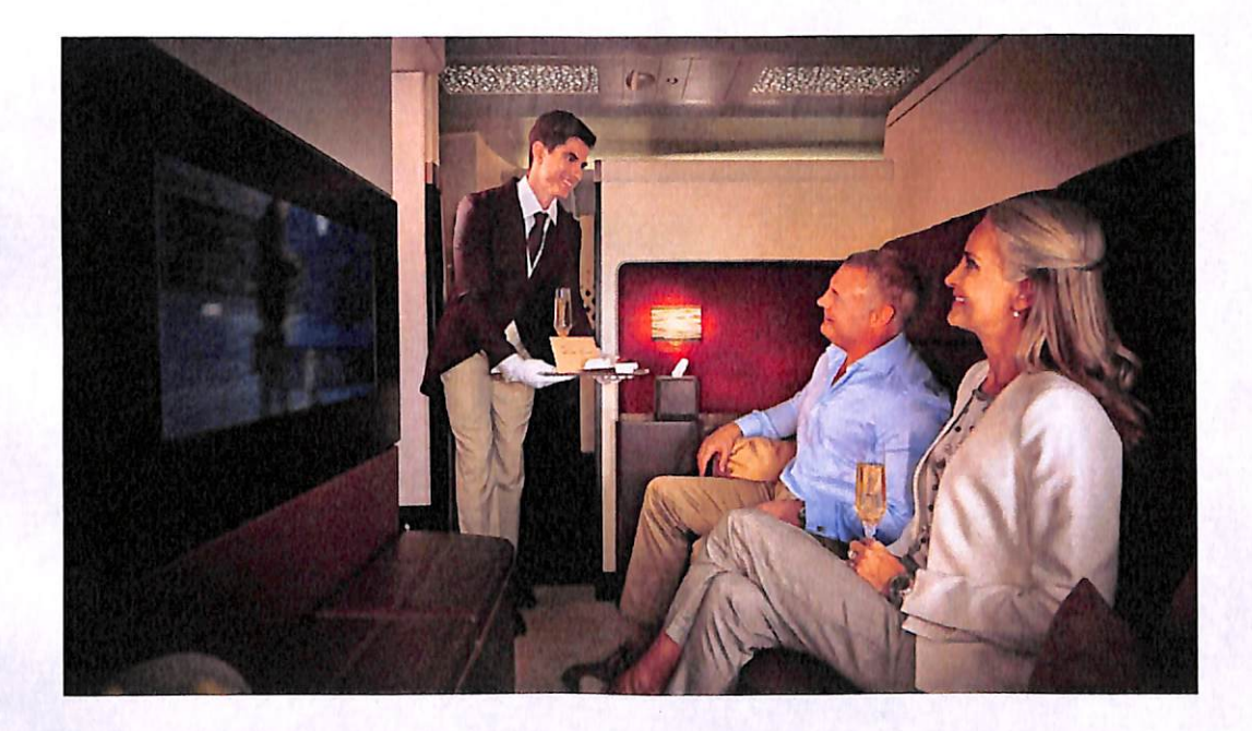
FIGURE 4: IN-FLIGHT SERVICES IN ETIHAD AIRWAYS

In aviation, in-flight service refers to offerings by an airline, both free and paid that add to a passenger's flying experience. Such items provided as in-flight services may include meals, snack, beverages, in-flight entertainment made available during a flight for the convenience of the passenger. In-flight entertainment refers to the entertainment available to aircraft passengers during a flight such as LED screens with a collection of movies and songs, Wi-Fi etc.