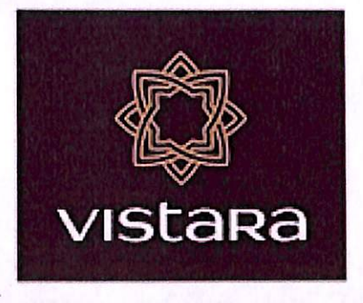
FIGURE 6: LOGO OF VISTARA AIRLINES

airline industry. With this, Vistara becomes one of the select few airlines in India to have the IATA membership. Vistara announced on 11 July 2019 that their first international destination would be Singapore. The airline started its first international service from Delhi to Singapore and Mumbai to Singapore on 6 and 7 August respectively using the Boeing 737–800 NG.