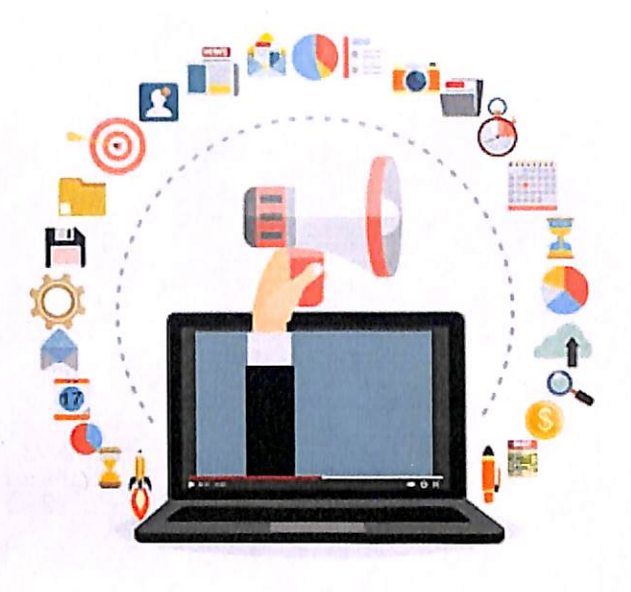
FIGURE 2: E-CRM