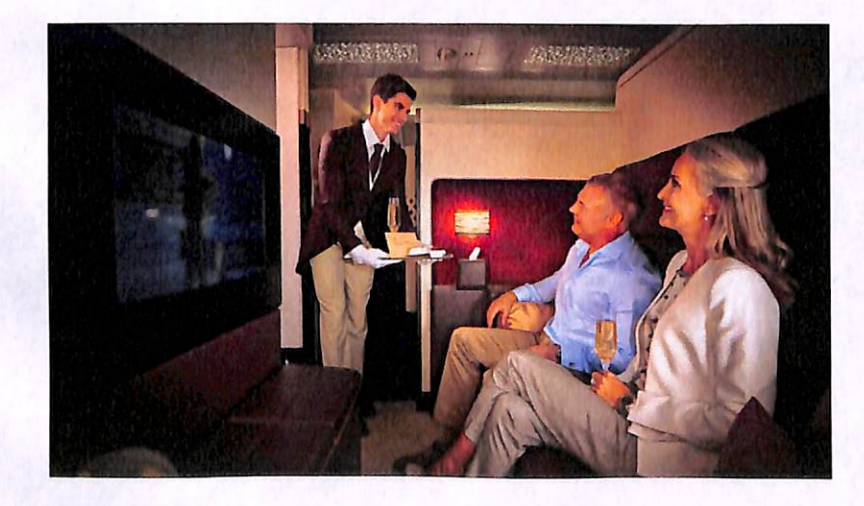
FIGURE 9: PASSENGERS BEING SERVED IN ETIHAD AIRWAYS

Etihad guest loyalty members are rewarded with Etihad miles when they book accommodations through booking.com as a result of a deal inked between booking.com and Etihad airways in 2019.