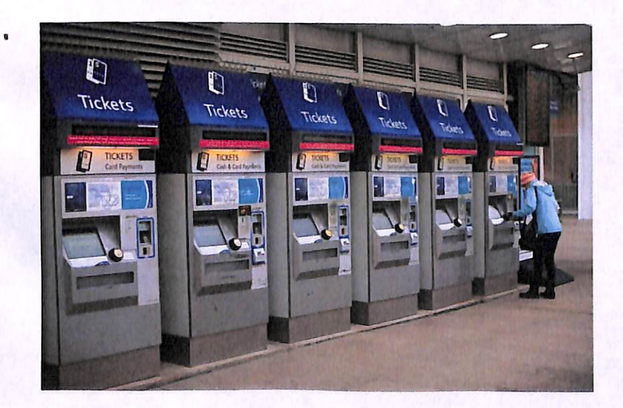
FIGURE 3: AUTOMATIC RESERVATION COUNTERS

of reduced fare. CRM for airlines helps to integrate electronic data interchange and quality. The aviation industry requires decisions to be made in a timely manner and with absolute accuracy. This can be achieved through implementing CRM for the entire process. It will ensure that the management has effective control over financial and industrial activities and in turn enhanced operations and efficiency. The effective use of customer relationship management helps the airline to identify the customer's complaints easily and provide adequate solutions to their problems. Scenarios such as flight delays or cancellations, lost baggage are some of the areas which can be improved by the effective use and implementation of CRM. Following CRM strategies in reservations is also an important element for customer satisfaction. Nobody is interested to stand in a long que for booking tickets. Providing the CRM Automatic Reservation Counter facility will help the passenger to spend limited time at the counter. Giving preference to the elderly and those who are in need will help the airline to maintain a good customer relationship. By these customer relationship management programs, the airlines can achieve their organizational goals with satisfied and retained customers.