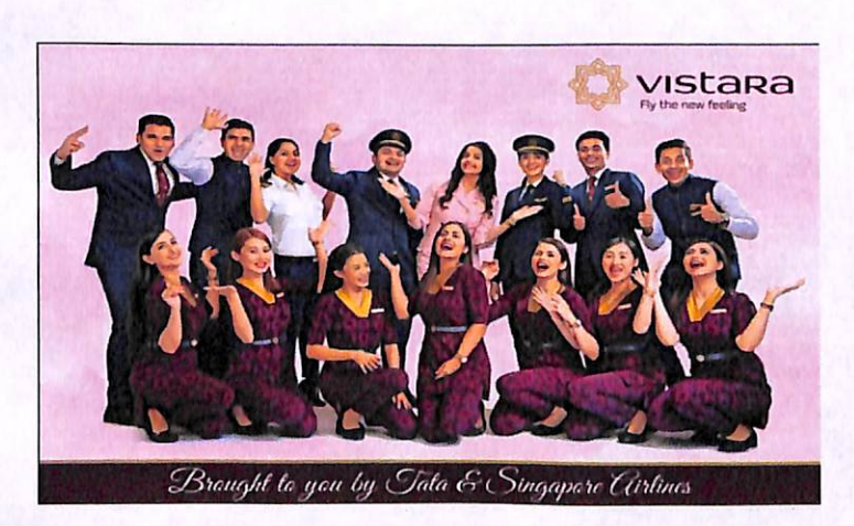
FIGURE 7: AIRLINE CREW AND GROUND STAFF OF VISTARA AIRLINES