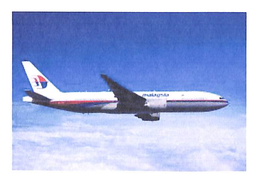
FIGURE 1: M370

The target of the Dissertation is to dodge future episodes and guarantee wellbeing dangers and to go into insights concerning the elements looked by Malaysian government and the Aviation Industry for the benefit of the vanishing of MH370.It mostly centers around the hunt that occurred, the potential reasons for vanishing, the risk that must be looked by MAS and how did the dealt with the emergencies. It was on March eighth 2014,a Boeing 777 flying machine worked as Malaysia Airlines flight 370 (MH370) was lost from the screens of the ATC during an hour or take off from Kuala Lumpur to Beijing in the People's of China conveying 12 teams and 227 travelers.