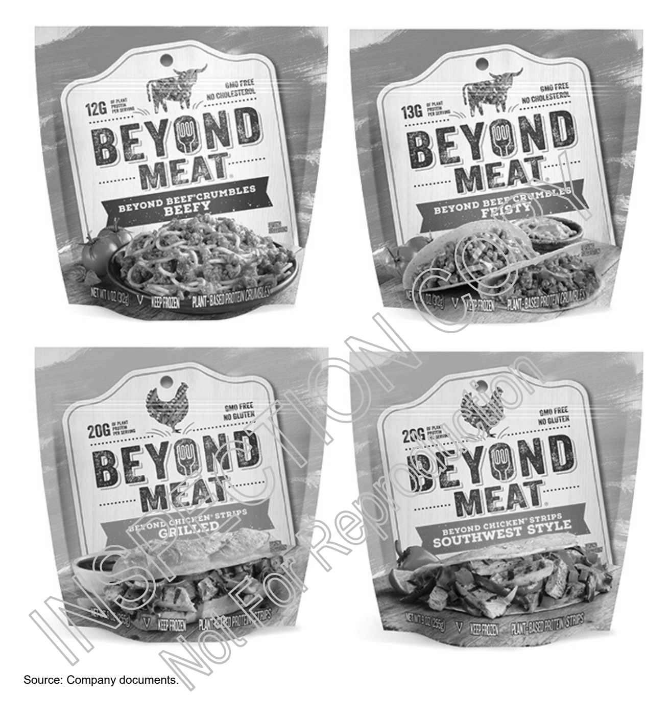
EXHIBIT 5: BEYOND MEAT PRODUCTS AND PACKAGING