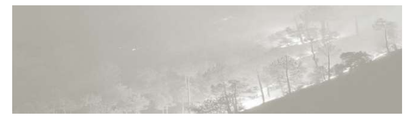
Fig. 2: Forest Fire in Uttarakhand

Thus dry weather, low seasonal rain and vapour pressure deficit followed by burning of pine needles, burning of litter and shading of plants by local people and unsustainable forest conservation policy are all responsible for forest fire in Uttarakhand.