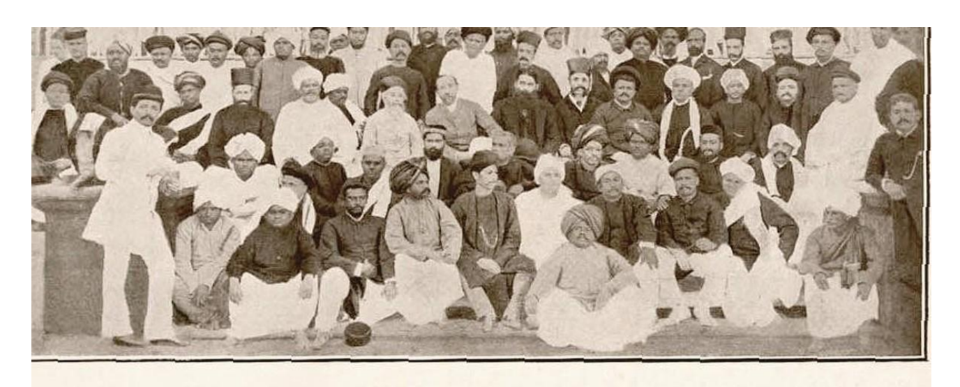
THE FIRST INDIAN NATIONAL CONGRESS, 1885.

urge of the politically conscious Indians to set up a national organization to work for their betterment. Its leaders had complete faith in the British Government and in its sense of justice. They believed that if they would place their grievances before the government reasonably, the British would certainly try to rectify them. Describe the initial two phases, i.e., Moderate and extremist phase of national movement of India. (25 marks)