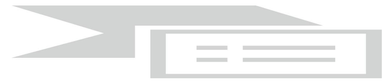
Figure 5.1: Data Management Through Coding Matrix

Data for hundreds of pages of different documents and hours of interviews was managed through the 'Data Management' stage. The qualitative data was mainly in the form of documents. Interviews and discussions were also converted into the written form. Important phrases of paragraphs or sentences of highly rich documents were put into the form of quotation and then summarized by developing open codes or in-vivo codes. In-vivo codes are backed within the framework analysis as a means of staying 'true' to the data (Ritchie and Lewis 2003). Preliminary thoughts were written to have the more formal ideas about the generated codes. Based on the in-vivo codes and preliminary thoughts; categories were developed. This all led in the familiarization of data. The flow of data management is illustrated in Figure 5.1 through the coding matrix of codes and categories. The coding matrix enabled the progress to be recorded and changes to be tracked.