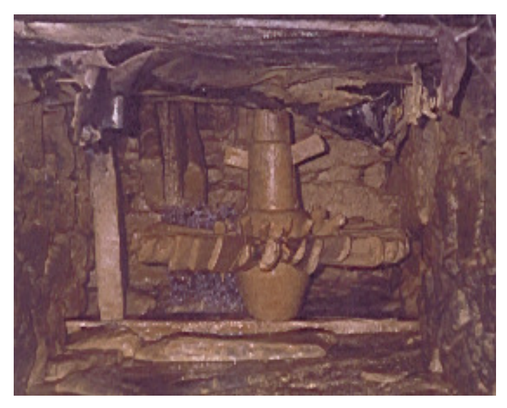
(Fig 1.1: Traditional Wooden Watermill Installed at Katapathhar)

It is important to note the advantages inherent in the indigenous watermill technology, in particular it is: