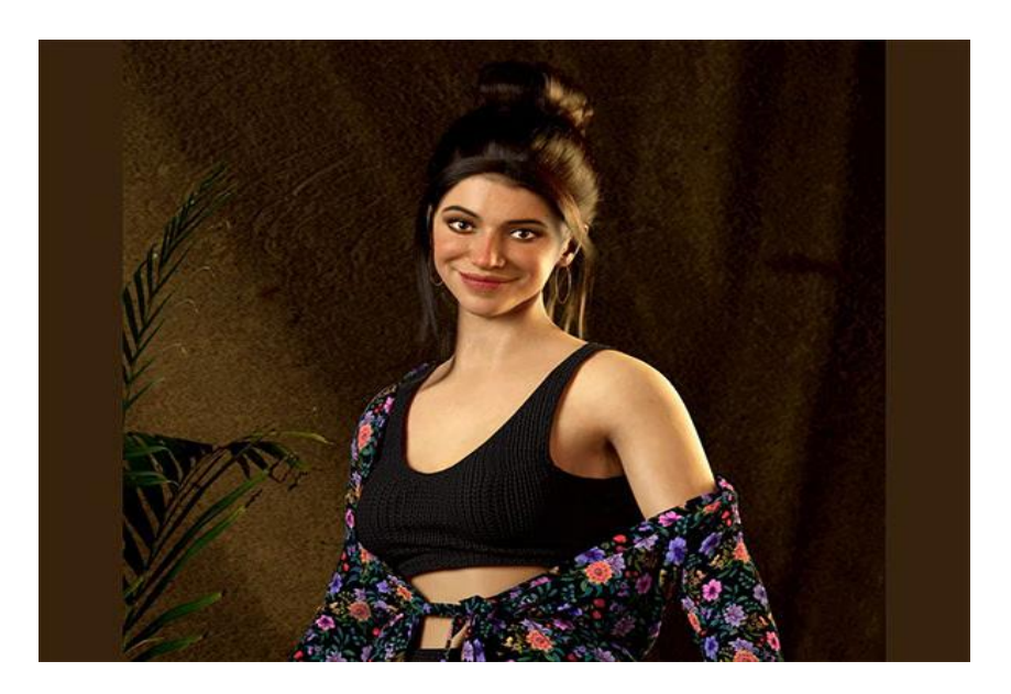
Xhadow Media Launches Female Virtual Influencer 'Sanvii' Powered by AI and 3D Visualization

Sanvii, as conceived by Xhadow Media, is more than just a virtual influencer. Her presence on Instagram presents a captivating synthesis of trendsetting fashion, aspirational lifestyle content, and thought-provoking insights - all intricately designed to resonate with a diverse audience.